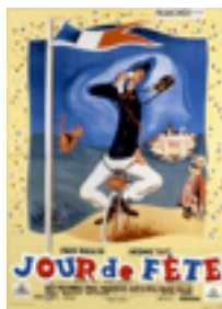
Jour de fête 1949