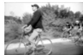
Ecole des facteurs (School for postmen) 1947