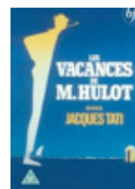
Les vacances de M. Hulot 1953