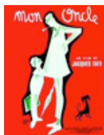
Mon Oncle 1958