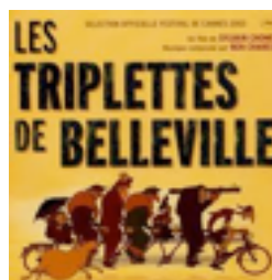
Belleville Rendez-vous Sylvain Chomet 2002